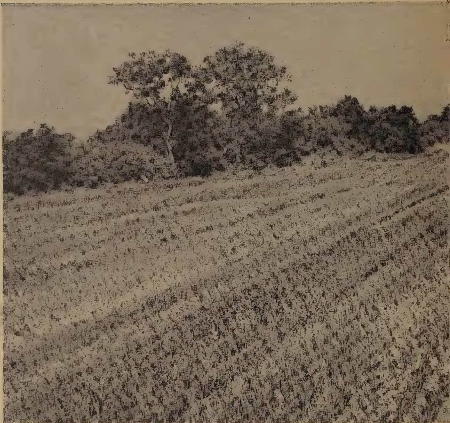
Part of our field in July. Foreground is small bulbs blooming.

FORT GARRY 452 (Glass, '47)— M —Deep velvety red, lighter in its mid-ribs. Opens 7-8 florets on a 20-bud spike. Lg. 35c; Med. 25c; Sm. 2 for 25c Bts. 8 for 25c; Unit $2.00.